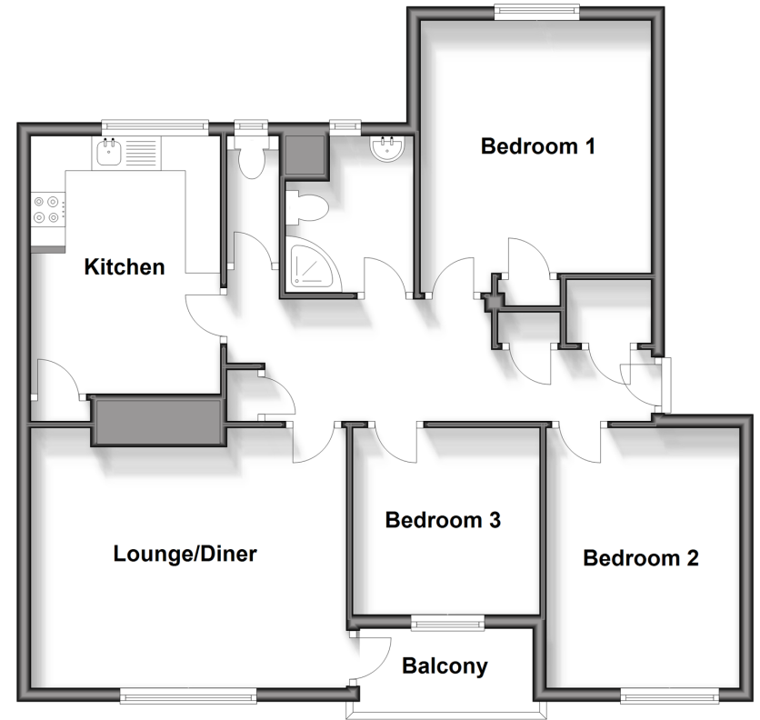
Third Floor Approx. 78.7 sq. metres (847.3 sq. feet)

Call Woodford Green - 020 8505 6343 ■ douglasallen.co.uk