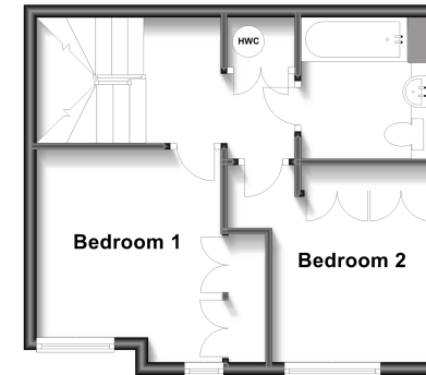
Second Floor Approx. 8.2 sq. metres (88.6 sq. feet)